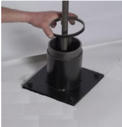
Figure 2 (if required)